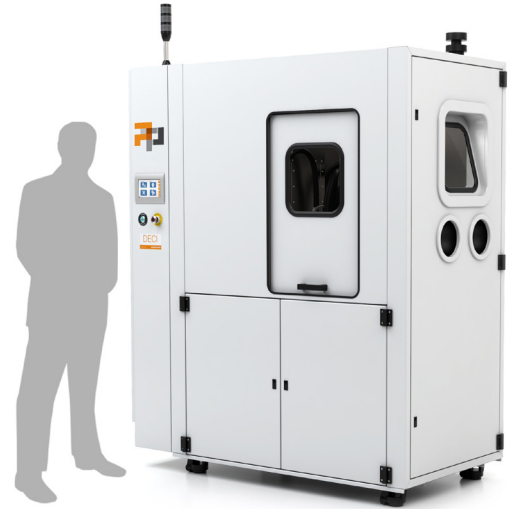
Figure 6: PostProcess Hybrid DECI Duo for Support Removal and Surface Finish

The key advantages of both SLS and MJF powder bed technology, including elimination of support structures, nesting parts vertically, and reclaiming the 'support' material, are beneficial to anyone in the additive manufacturing space. However, the drawbacks can throw a wrench into a workflow unprepared to deal with its shortcomings: a stubborn final layer of powder and the gritty surface finish. The DECI Duo can remove powder support material and provide the desired surface finish under the same hood, all while preserving fine-detail part geometries and freeing up labor. If you are going full speed ahead with powder bed technology, the DECI Duo is the F.A.S.T. post-print solution.