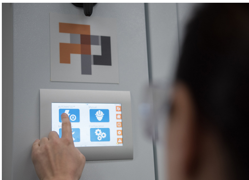
Figure 5: AUTOMAT3D software screen

After the work is done, powder removal clean up can be a messy process. The DECI Duo has an automated Media Separation Sequence (MSS) to address this issue. A filtration basket is placed on the turntable to capture the waste for easy disposal of the solids. For optimal performance, it is recommended to run the MSS at least once for every 10 lbs of powder cleaned in the system, or every two months, whichever comes first. With the AUTOMAT3D software, the user is reminded of this task along with other preventative maintenance alerts.